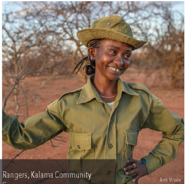
Rangers, Kalama Community Conservancy