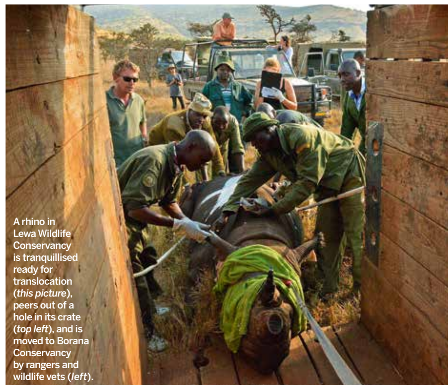
A rhino in Lewa Wildlife Conservancy is tranquillised ready for translocation (this picture), peers out of a hole in its crate (top left), and is moved to Borana Conservancy by rangers and wildlife vets (left).